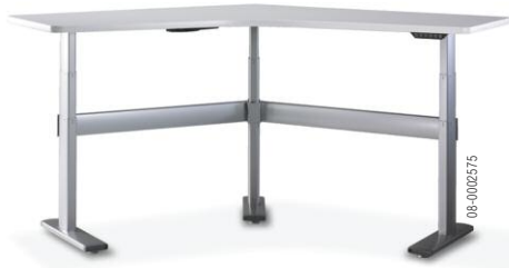
Series 7 120°, standing height