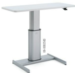
Airtouch Rectangular, standing height