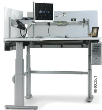
Series 5 90°, standing height