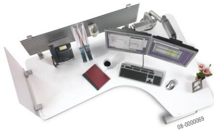
Series 7 90° Boot , overhead view