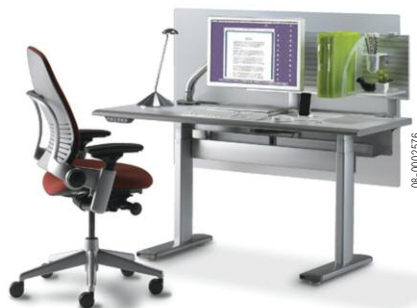
Series 7 Rectangular, seated height