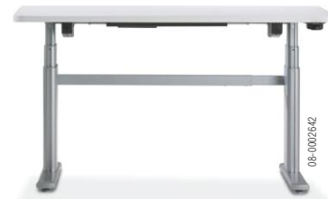
Series 5 Rectangular, standing height