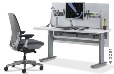
Series 3 Rectangular, seated height