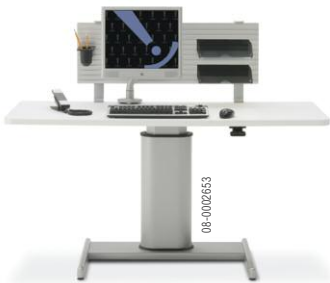
Airtouch Rectangular, seated height

So many ways to configure for so many different figures. Go figure.