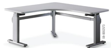
Series 5 120°, seated height