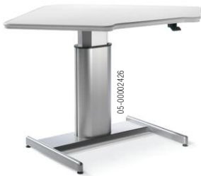
Airtouch Corner, seated height