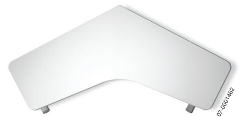
Series 3 120°, overhead view