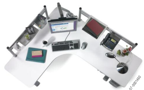
Series 3 90°, overhead view