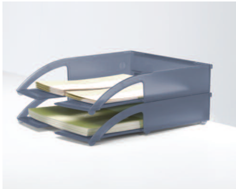
10" Portrait Letter Tray - Freestanding