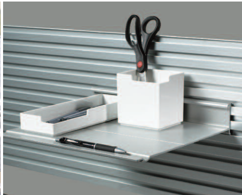
12" Slatshelf on Slatwall