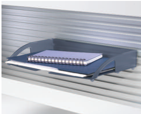
15" Landscape Legal Tray on Slatwall