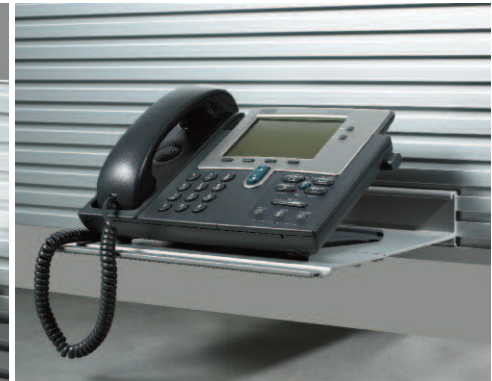
12" Slatshelf on Slatwall