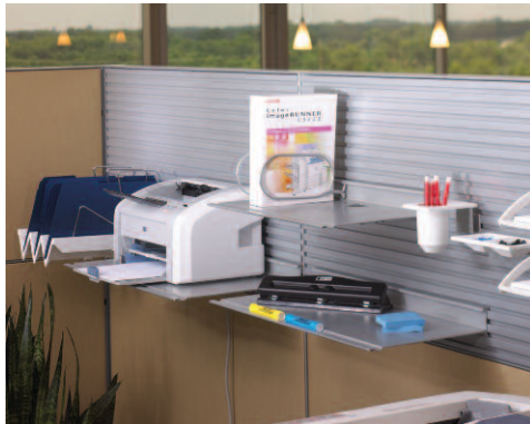
Slatshelves handle weight of printer, fax machine, postage meter to help organize copyroom.

Amazing how something so seemingly basic does so much to expand a worker's workspace, improve productivity, and recapture workspace dollars.